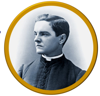
Venerable Fr. Michael McGivney

3259 Old Goldie Rd. Oak Harbor, WA 98277