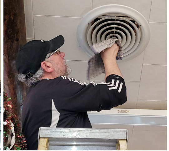
GK dusting...multi-talented this one!