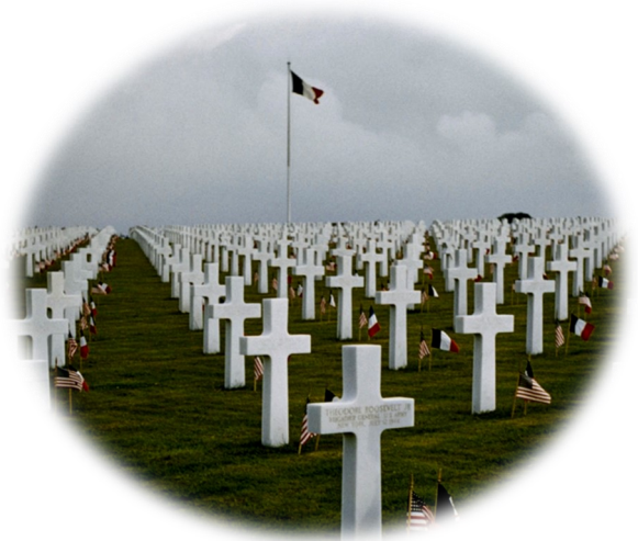
American Cemetery at Omaha Beach Normandy

From 1868 to 1970, it was observed on May 30 th , but is now observed on the last Monday of May. On this day, and especially this day, take time to ponder what these individuals did for our country... and you.