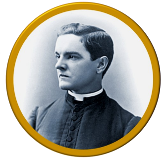
Venerable Fr. Michael McGivney

3259 Old Goldie Rd. Oak Harbor, WA 98277