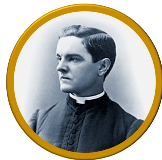
Venerable Fr. Michael McGivney

Father John E. O'Brien Council #3361 3259 Old Goldie Rd. Oak Harbor, WA 98277